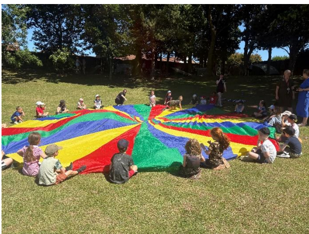
Year 1 playing parachute games