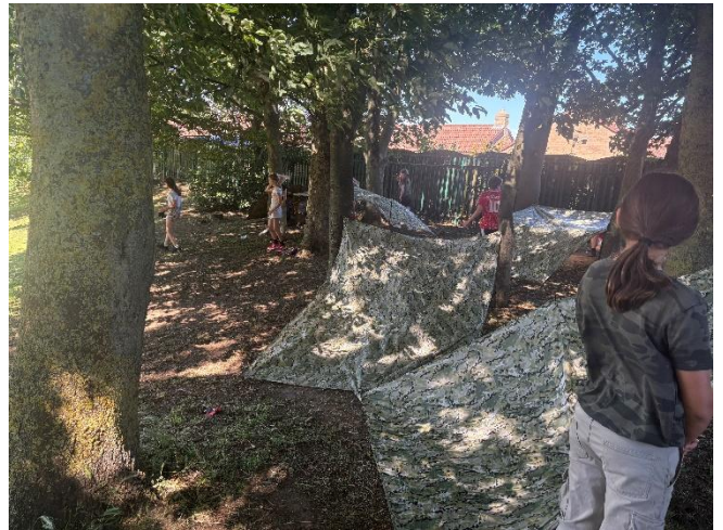
Year 6 building shelters

Please keep looking at the website where these are continually updated and new dates added. Thank you.