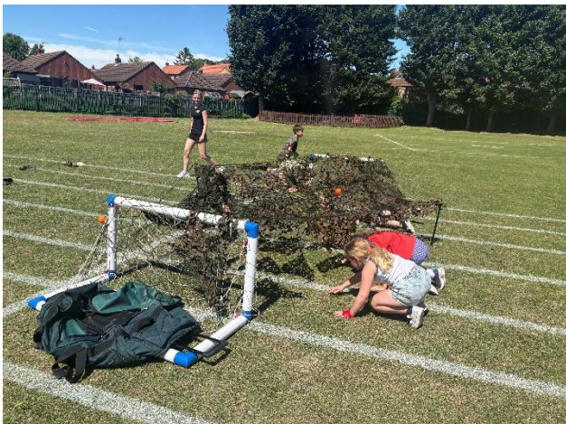
Year 3 under the cargo net