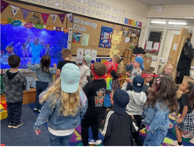
Reception Class 'rocking out'