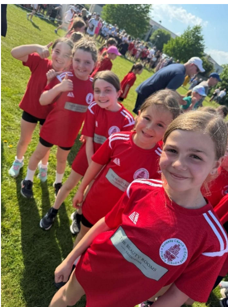
Some of our wonderful cross-country runners